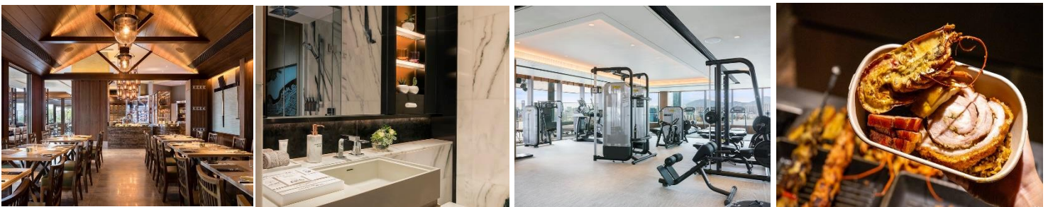
** All photos from hotel official website **